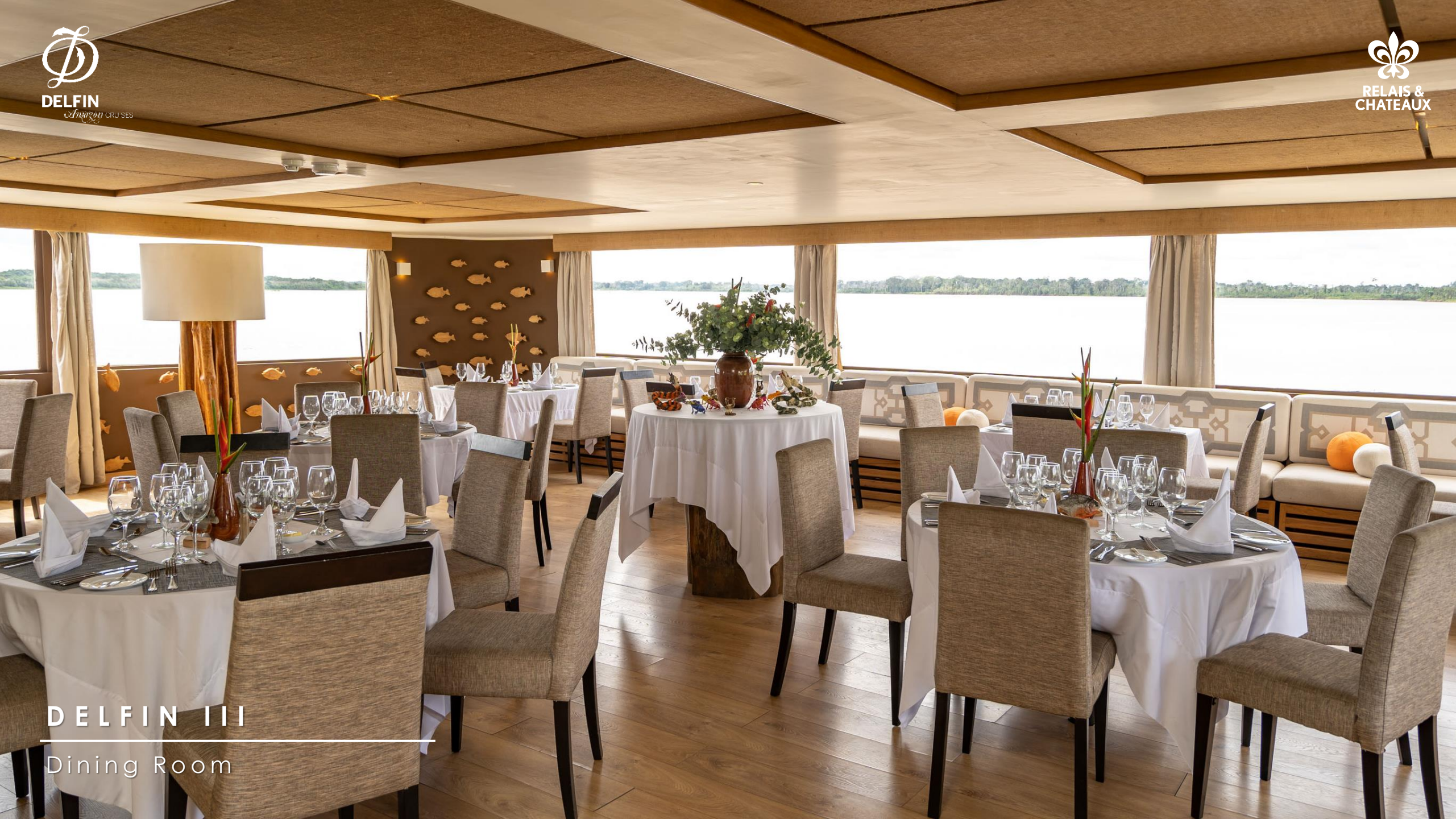
DELFIN III Dining Room