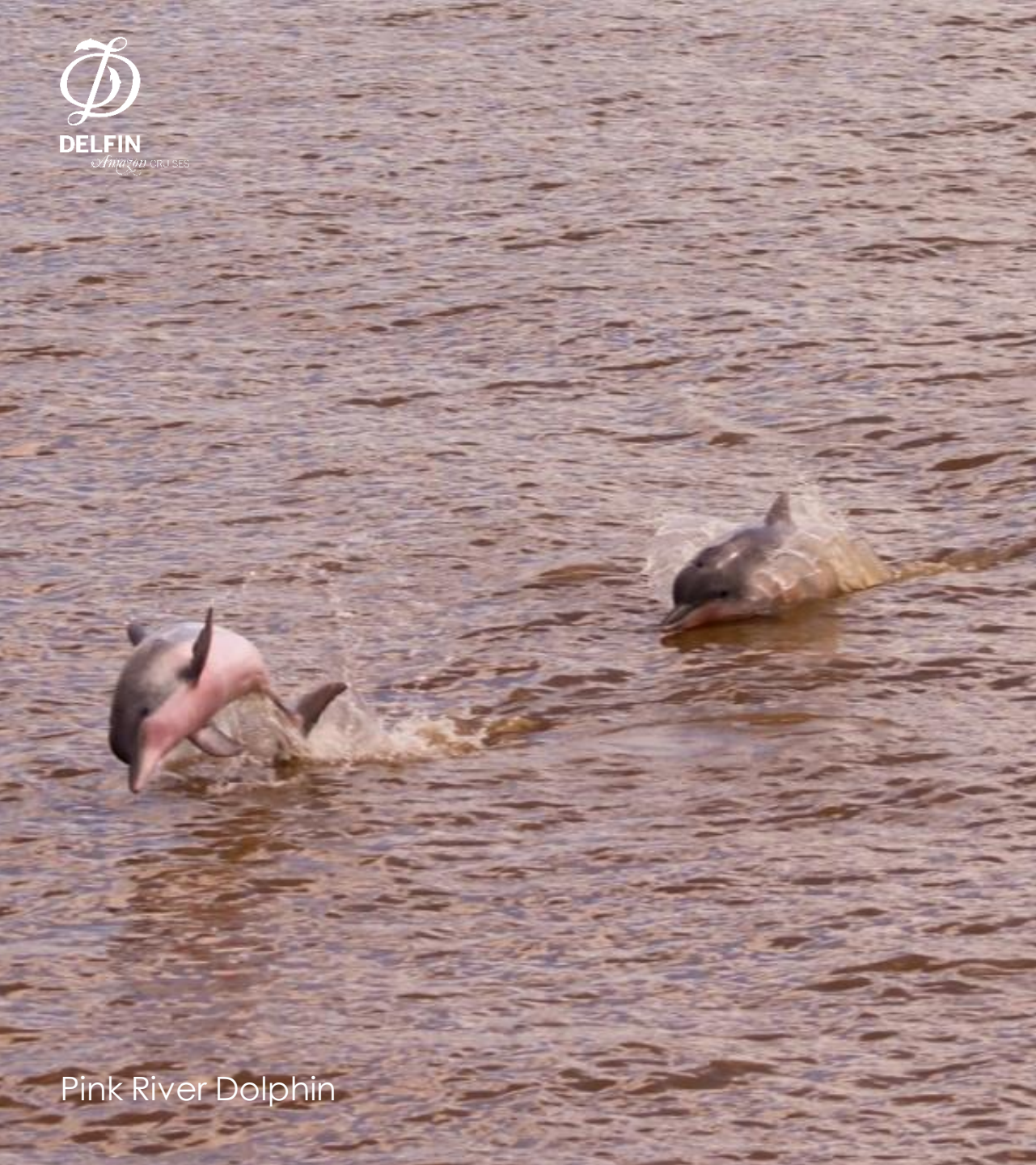
Pink River Dolphin