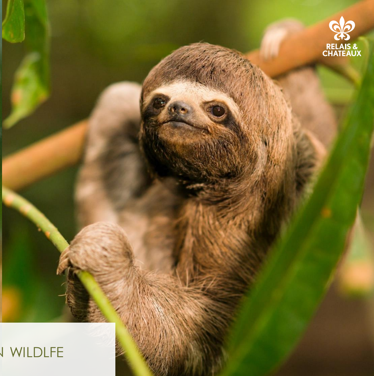
Three Toed Sloth